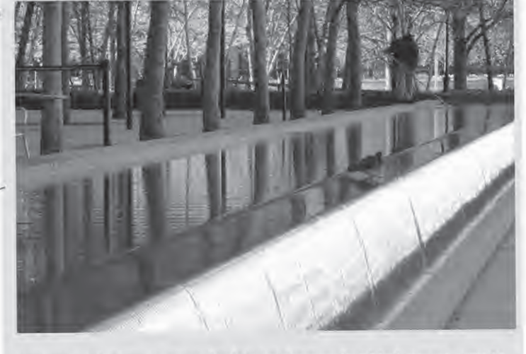
Battery Park City is great for bike riding, roller blading, or simply taking a stroll. Battery Park is surrounded by plenty of cute cafes.