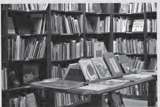
The Housing Works Bookstore on 126 Crosby Street is a nonprofit bookstore and cafe that donates all proceeds to fight homelessness and AIDS. The bookstore frequently hosts special events such as The Moth Story