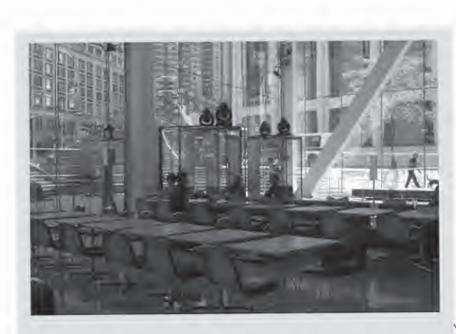
The Lincoln Center area is always busy. Go during fashion week or during the holiday season to catch a performance of The Nutcracker at the ballet. Lincoln Center Cinemas is a great New York City movie house. Grab a snack at Alice Tully Hall before your movie; the cafe has excellent freshly brewed iced teas, cookies, and sandwiches that are great for sneaking into the movie theater.