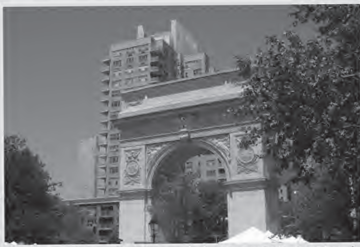
Washington Square Park frequently has a vacant piano stationed at a random location. Go to play or enjoy music or even to see if you can pass for an NYU student.