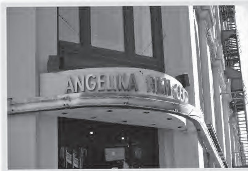
The Angelika Film Center on 18 West Houston Street is an art house, cafe, concession stand, and movie theater all in one. It plays a large number of independent films.