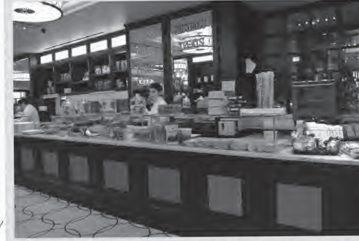
The Plaza Food Hall in the basement of the Plaza Hotel (768 5th Avenue) is composed of different food themed stations. The prime rib sliders are incredible and should be supplemented by a plate of parmesan cheese french fries.