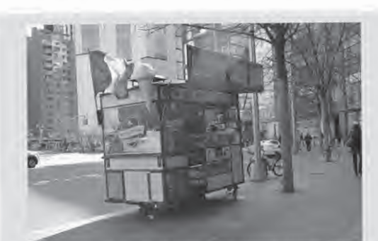
Columbus Circle (Corner of West 59th Street and Central Park West) is the permanent home to one of New York City's Waffles and Dinges Trucks. These doughy waffles go perfectly with Speculoos sauce and a rich Belgian