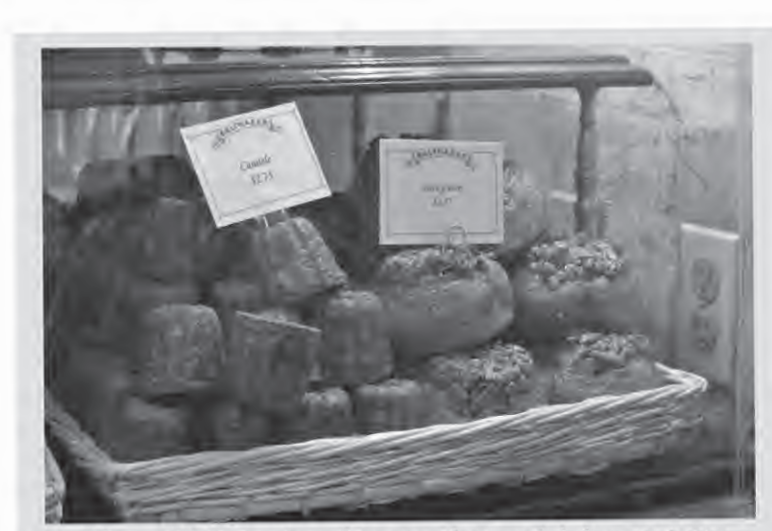
Balthazar (80 Spring Street) is a terrific French bakery in SoHo. Their scones are out of this world and the chocolate croissant is perfection. Pick up a loaf of their delicious walnut bread and if you finish it on the train back to Port Washington, don't worry; we've all been there.