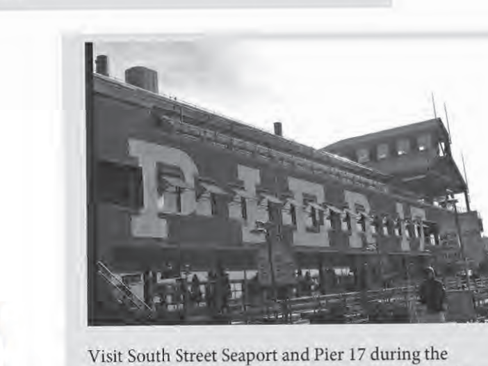
summer for the free Seaport Music Festival. Also, be sure to visit the TKTS ticket booth for discounted Broadway show tickets. The South Street Seaport ticket booth is much mellower than its Times Square counterpart.