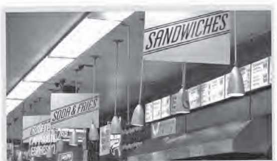
Katz's Deli on 205 East Houston Street is the place to go for delicious meat. Be prepared: the sandwiches are expensive but well worth the price. Sit down with a pastrami sandwich and a cold Dr. Brown's Cream Soda.